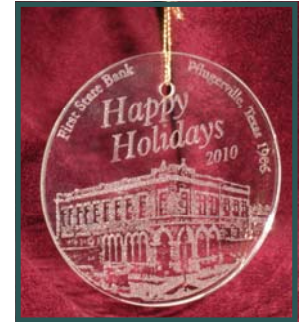
First Annual Historical Holiday Ornament.

The ornaments make the perfect gift for collectors and community residents.